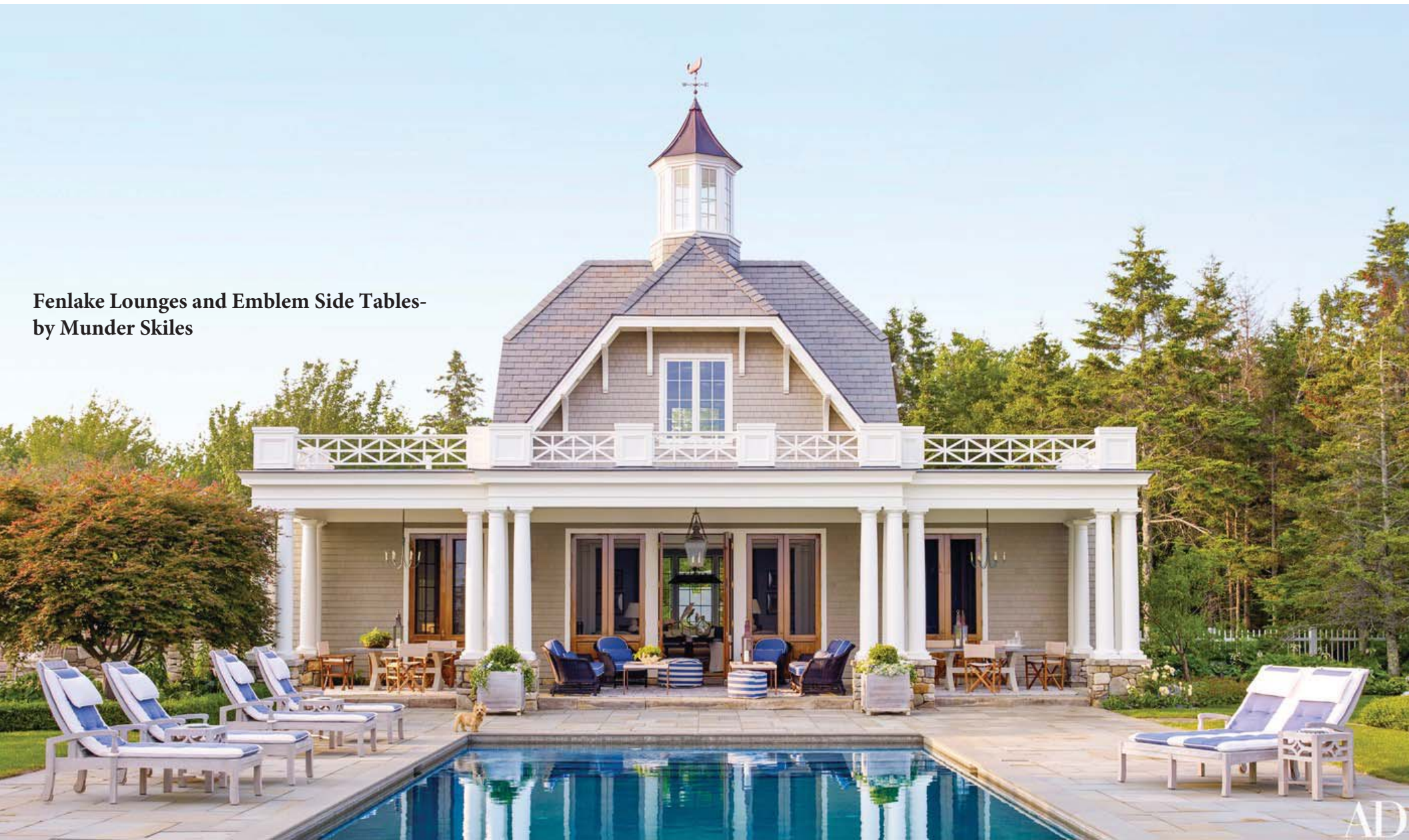
Fenlake Lounges and Emblem Side Tables- by Munder Skiles