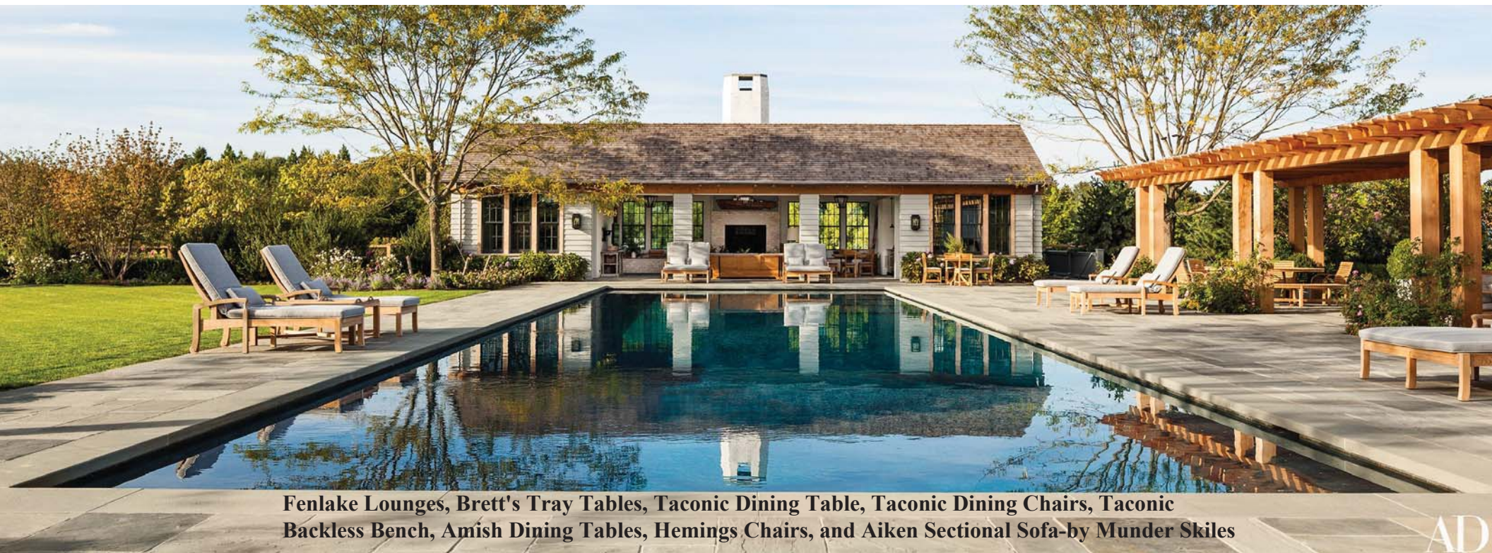
Fenlake Lounges, Brett's Tray Tables, Taconic Dining Table, Taconic Dining Chairs, Taconic Backless Bench, Amish Dining Tables, Hemings Chairs, and Aiken Sectional Sofa-by Munder Skiles