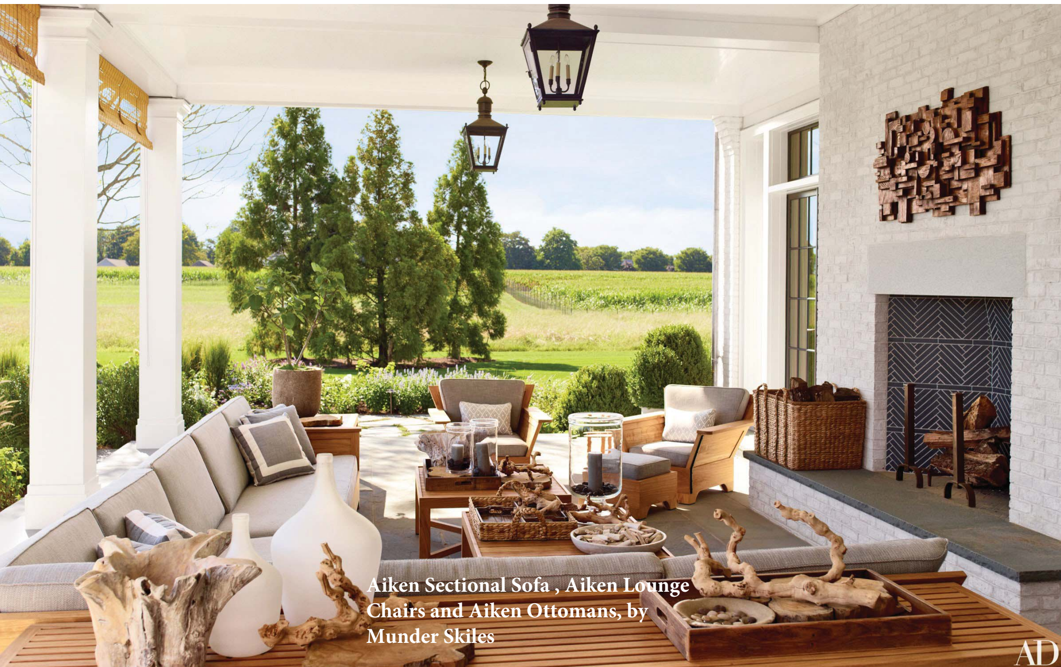
Aiken Sectional Sofa , Aiken Lounge Chairs and Aiken Ottomans, by Munder Skiles